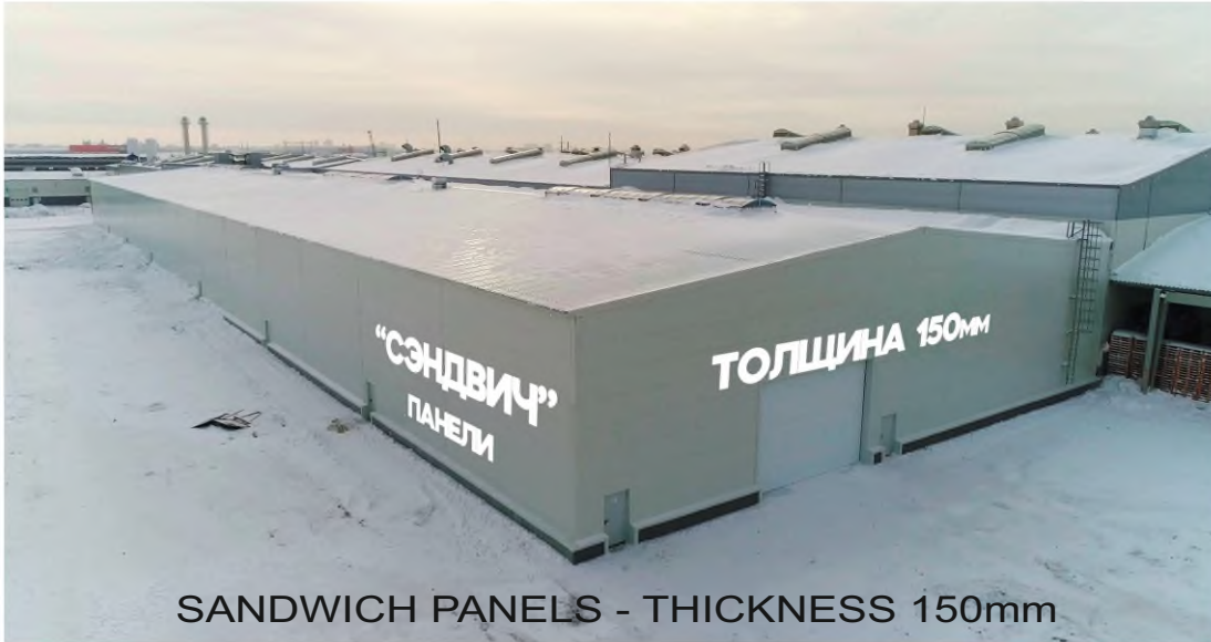
SANDWICH PANELS - THICKNESS 150mm