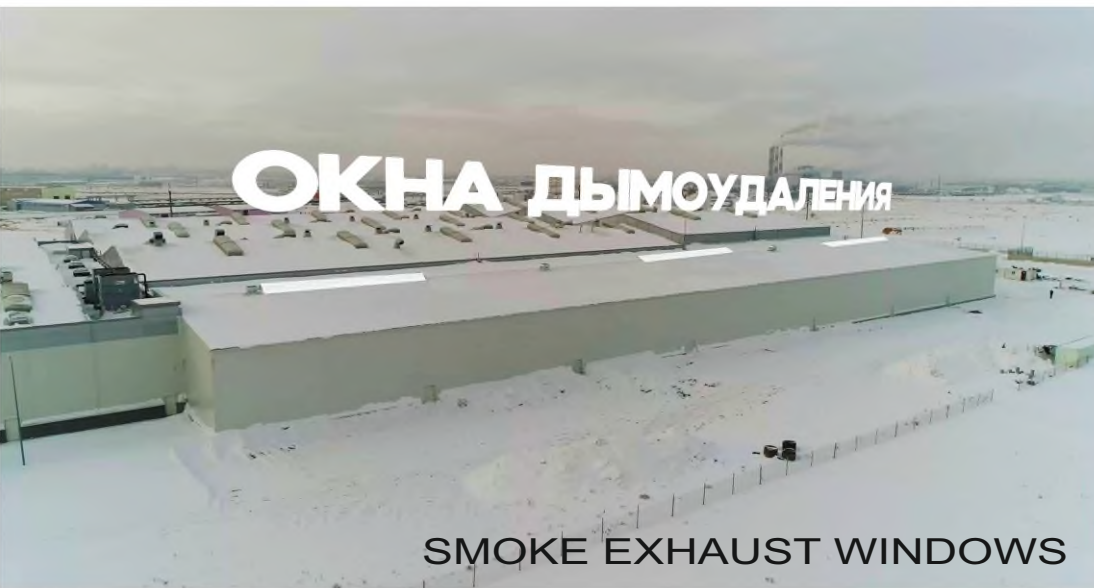
SMOKE EXHAUST WINDOWS