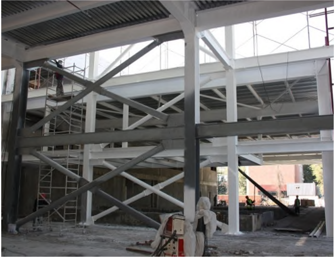
SWIMMING POOL. WIDTH OF SPAN – 21M