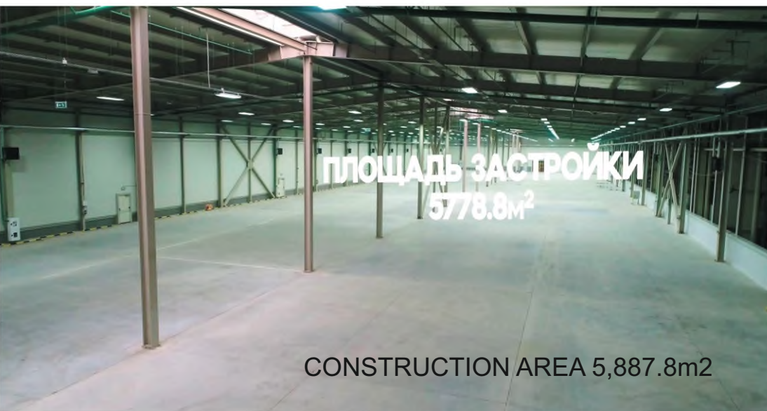
CONSTRUCTION AREA 5,887.8m 2

SOFT DRINKS PRODUCTION PLANT INNUR-SULTAN (FORMER ASTANA CITY)